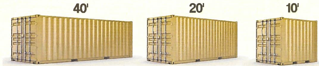
Figure 1-2 Intermodal Container

Living Quarters is defined as an area considered being a place of residence, whether permanent or temporary.