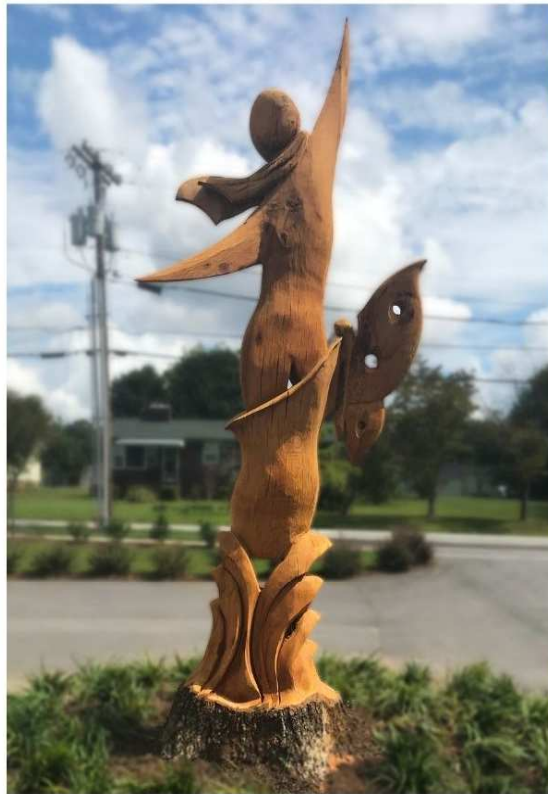
Living Tree Sculpture-Center For The Arts

"Creating Community through People, Parks, and Programs"