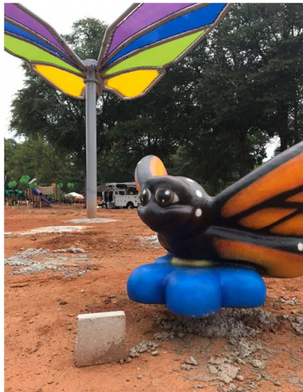
Kids Planet Playground

"Creating Community through People, Parks, and Programs"