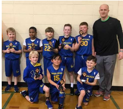
8U Basketball All Star Team Western District Champions

"Creating Community through People, Parks and Programs"