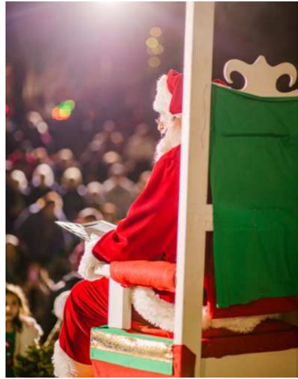
Santa Claus recited 'Twas the Night Before Christmas for one of the largest crowds in the history of the Christmas Tree Lighting event.