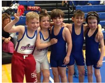
Tomahawk Youth Wrestling League

The City of Greer Parks and Recreation Department is committed to fulfilling our mission of providing quality recreational experiences while administering the values of community image, human development, preservation of environmental resources, health and wellness, economic development and cultural unity.