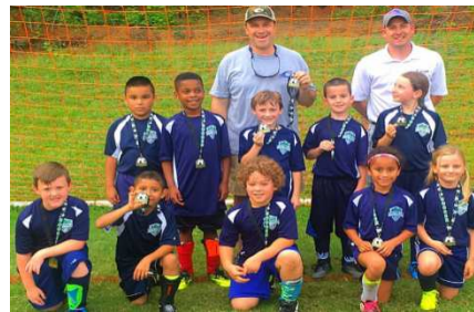
Soccer 8U Champions

The City of Greer Parks and Recreation Department is committed to fulfilling our mission of providing quality recreational experiences while administering the values of community image, human development, preservation of environmental resources, health and wellness, economic development and cultural unity.